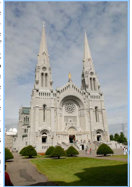
Ste. Anne de Beaufre

We both applied for this pilgrimage not only for the Eucharistic Congress, but also to be able to visit and appreciate the culture and spirituality of Quebec City. During our pilgrimage to Quebec, we will be making a stop to one of the Redemptorist Churches, "Ste. Anne de Beaufre." Ste. Anne de Beaufre is a church that represents Jesus' grandmother, much like our church St. Joseph commemorates Jesus' father. During this visit, the church will be celebrating its 100th Anniversary; what an awesome gift!