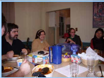
Team Training Day

I will never forget the quieter student who was just bubbling over with excitement on retreat day. It reminded me a lot of myself in high school. I got the sense that it was there, on retreat, that she was able to be open about her faith.