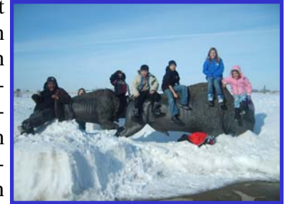
Riding the buffalo at

these have included attending a hockey game and a dinner theater, with children from inner city schools. Yet perhaps the most memorable was these was an out reach entitled "God in Nature", in which we boarded a bus on a Saturday morning all sporting freshly made "I love St. Mary's" clothing, and spent the day having fun and emerging in culture with interactive outdoor activities at Wanuskewin Heritage Park. Seeing the pure joy in how these children celebrated the beauty of God's