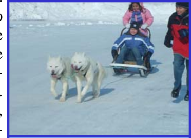
Dog Sledding Activity at the Wanuskewin Heritage Park

Serving as a senior youth coordinator, meaning those in grades nine to twelve, there have also been some wonderful opportunities at St. Mary's to plan, and partake in outreaches with children and youth of all ages. Some of