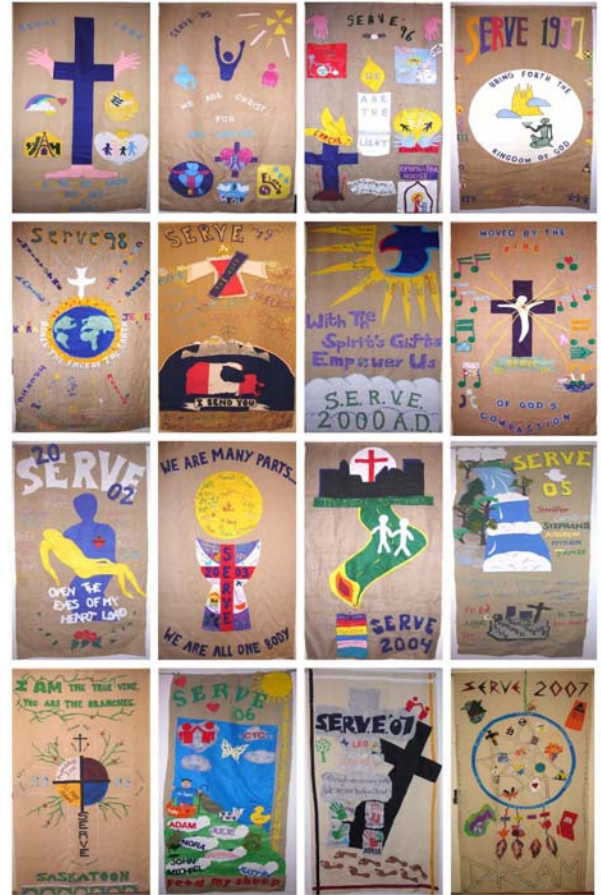
The Redemptorists: Edmonton-Toronto Province