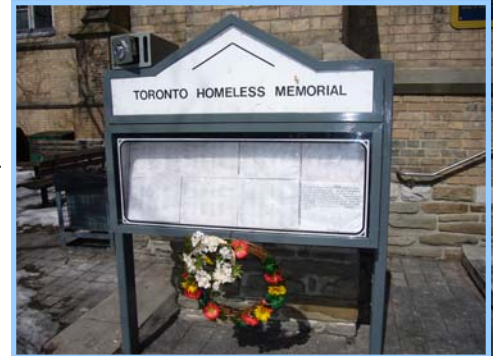
The Homeless Memorial—Toronto

in her final year at the University of Toronto studying Aboriginal, Diaspora and Transnational Studies. She loves music, plays a great guitar and swing dance lessons!