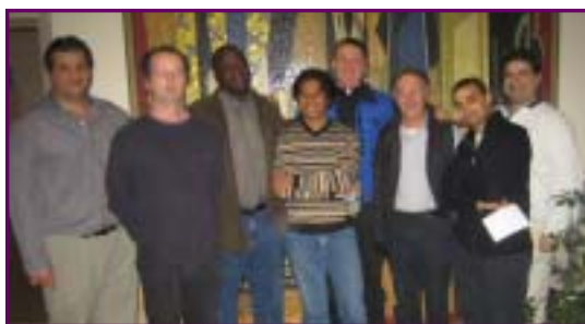
General Secretariat for RYVM

Some of the decisions being worked on as a result of our meetings include: The contest among youth/young adults across the globe for a new RYVM Logo, inviting Y/YA to give input about the needs of Y/YAs in today's world and Church, the planning of regional meetings: like this year's DIALOGUE 2006 in Hamilton, Ontario, strategies for support and promotion of the RYVM Programs across the globe via internet, and many more! Needless to say, you will be seeing more information about our plans in the coming months on our website, and through the newsletter.