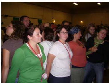
Learning some fancy Irish footwork!

God loves us so much that he became human, complete with the feelings of pain and hurt that we sometimes feel. He gave his life for us on the cross out of love, so that we have eternal life. Mary agreed to be the mother of Jesus out of love for God. She raised Jesus to the best of her ability, loving him, and guiding him into the man he became to fulfill his mission in our world. The Eucharist was given to us out of love from Jesus, so that each time we consume, we remember his love, the root of our Catholic faith. Eucharist is more than receiving the body and blood of Jesus at Mass each week. Eucharist is our mission to show love to every person we encounter, every day. Eucharist is our mission. Love is our mission. Just as God is so crazy in love with us, we must give of ourselves to others in that same passionate way.