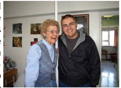
Sharing a laugh with a resident at Porteous Lodge

majority secular and none of them were offering what I was looking for – to be able to bring my faith and my interests together in order to grow spiritually while assisting others.