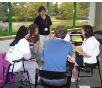
Attending great workshops!

Over 600 young adults and Redemptorists from across Europe, North America and South Africa were united in