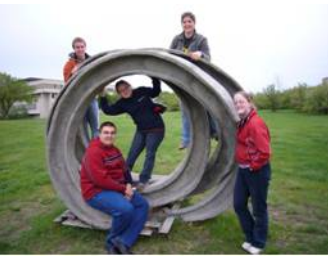
Visiting the Sculpture Park at the university.