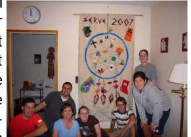
Proudly displaying our banner!

I will not go into detail about the program for those of you who might be considering being part of it because I believe that a huge part of the SERVE experience is gaining the ability to trust in God. I want to say for those who are familiar