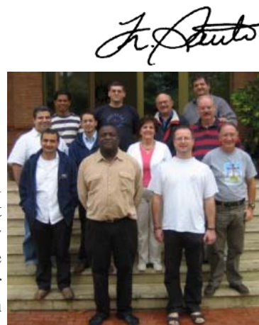
General Secretariat for Redemptorist Youth and Vocation Ministry Meeting in Lariano, Italy

The meeting of the General Secretariat for Redemptorist Youth and Vocation Ministry in Lariano, Italy gathered the Regional Representatives for RYVM from North and South America, North and South Europe, Africa and Asia, with the Vicar General of the Congregation along with guest representatives from the Regions to reflect on the global sociological and spiritual realities of youth. Through comprehensive reports and presentations, the Secretariat reflected on future plans and programs that will benefit the work of the Redemptorists and youth throughout the world.