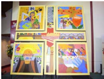
The completed banner created and personalized by each participant.

This theme “Crazy in love” at the European Redemptorist Youth Congress in Limerick, Ireland (L’07) was the focus of each day. The four days of