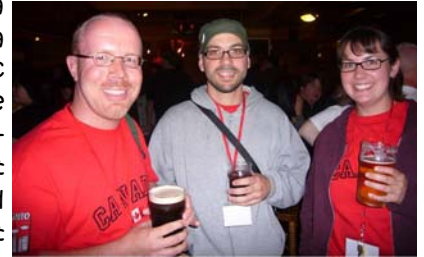
Relaxing with a wee pint and new friends at the pub.

I love participating in such events because of this energy. As well it gives me a sense of belonging to a much larger Catholic Community that is made up of many other faith-filled young adults. It also gives me a renewed grounding of my self. It allows me to take time and to prioritize the important things in my life, such as my faith, prayer life, my relationship with Jesus, family and friends, and my work. It also rejuvenates me so that I come home with a deeper sense of peace, of love and