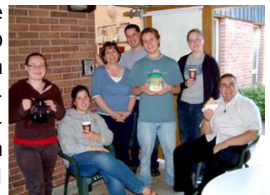
Showing off our sandwich offerings for the "Back Door" Program.

inviting me to participate in SERVE 2007! I was so excited before, and then with receiving the acceptance letter, that excitement seemed to turn into anxiousness. Was I ready to move away with strangers into a completely different life-