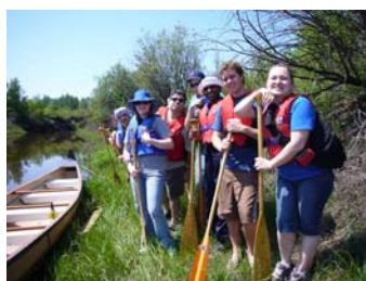
Ten of us in one canoe for three hours! Talk about working as a team and building community!

push the right button within me in that this program was offering the type of experience that I was hoping to obtain. You see, similarly to so many young people, I felt at that moment, like I could conquer the world. I wanted to leave my mother's nest and travel somewhere where I could really make a difference. I was looking at many different programs around the continent, for yes, I didn't want to stay in Canada – I thought that there were no problems in Canada. I thought that those things only happened outside our border. I had looked at so many organizations around the world, some religious, but the great