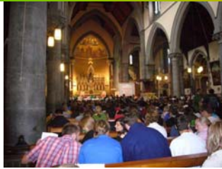
Gathering at St. Alphonsus Church after our Pilgrim Walk into Limerick

Pazzo per amore! Crazy in love! It is amazing just how crazy God is, crazy in love with each one of us. So crazy in fact, that he became a vulnerable, helpless, completely dependent human baby. So crazy, that Jesus gave up his own life on a cross, just so that we would live eternally. How lucky we are to be loved so intensely, so easily, and unconditionally, by God.