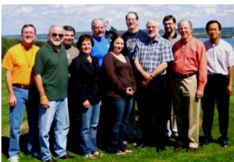
Redemptorists and Lay Collaborators meeting in Canandaigua, September 10-14, 2007

The meeting in Canandaigua was an opportunity for Redemptorists and Lay Collaborators working in Youth, Young Adult and Vocation Ministry to come together to share with one another what is happening in the North American Region, to vision for our young people and discerners opportunities to share in mission across the continent and beyond. Plans have also begun to reach out, train, and form lay collaborators who are working in youth ministry in Redemptorist Parishes across the Region by use of a Regional Conference. In our tradition of hosting Regional 'Dialogues' in North America, plans are in motion as well to host the next gathering. Dates and locations for both these gatherings will be announced over the next few months.