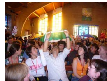
Closing Prayer Service

of hope. I have been reminded that no matter what happens in my life, joy or struggle I know that God is always with me. I have also been reminded to use the gifts and talents I have been given to continue to strive to do my best for others. The timing couldn’t be better. After returning from this congress, I only have a short time before I am back in my classroom teaching. I am strengthened from attending L’07 and will strive to demonstrate God’s love for each one of my students; use my gifts to help them find theirs.