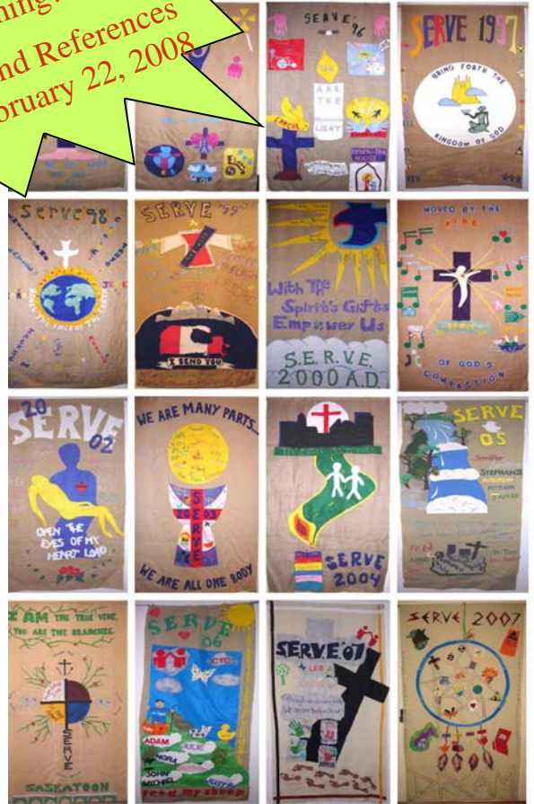
The Redemptorists: Edmonton-Toronto Province