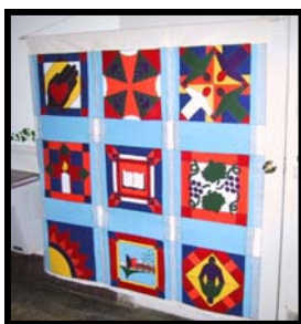
Banner representing 8 Components of Comprehensive Youth Ministry made by Redemptorist Youth Mission Team in St. Paul, AB, in 2000.

To learn more..... about Comprehensive Youth Ministry and links to Canadian Associations and Training, see the RYVM Website: www.ryvm.ca